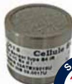
Infrared XP IR Sensor

Guaranteed for 3 years, the OLCT 60 XP IR version requires minimal maintenance and provides guaranteed extreme accuracy and constant stability.