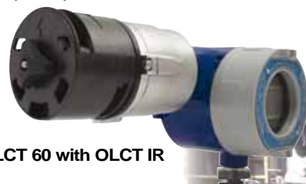
OLCT 60 with OLCT IR

This combination offers outstanding reliability (the OLCT IR has an MTBF of 28 years) and simple operation.